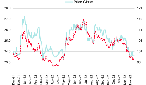
Charoen Pokphand Foods (CPF TB)